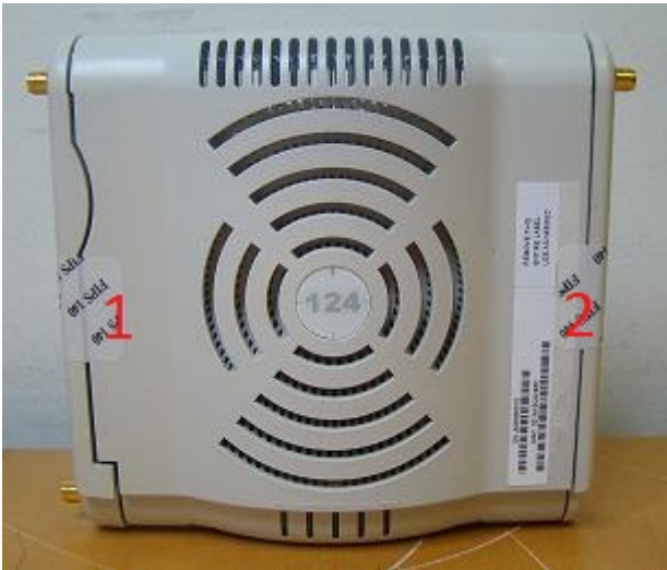
Figure 6: AP-124 Bottom view