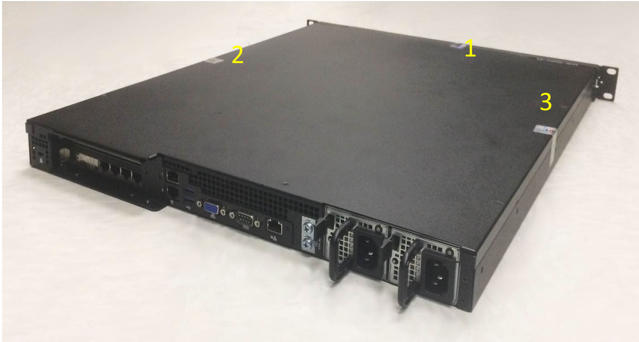
Figure 2 – Maxar AEDS (back) with Tamper-Evident Seals Locations