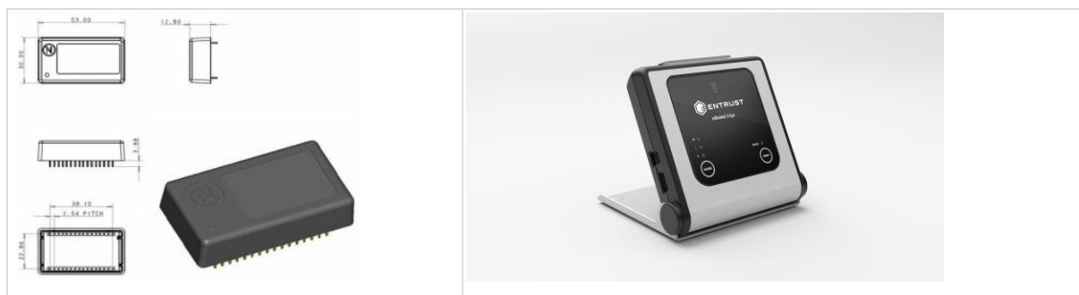
Table 3 nShield MiniHSM (left) and nShield Edge (right)

The table below shows the nShield MiniHSM and the nShield Edge