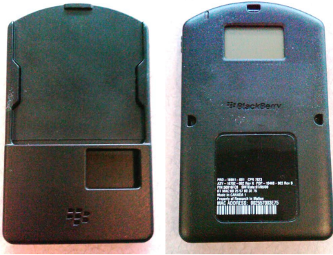
Figure 5 - Front and Back Sides of Module

To further ensure physical security compliance, the chip embodiment containing Module cryptographic Firmware and memory, including associated circuitry, is encased using an opaque potting epoxy which, when breached, will result in a high-probability of module failure.