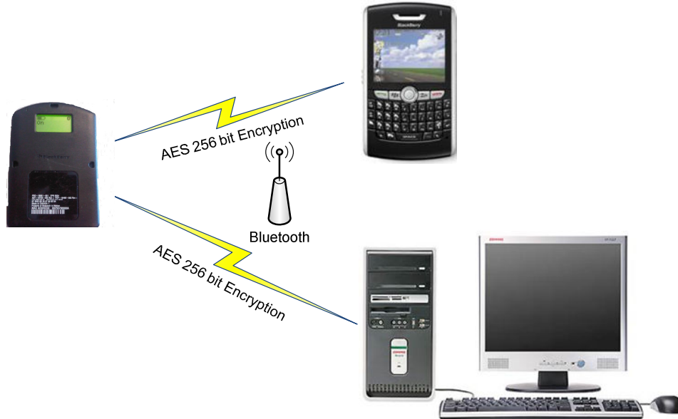
Figure 2 - BlackBerry Smartcard Reader Architecture

The BlackBerry Smartcard reader architecture is described by the following: