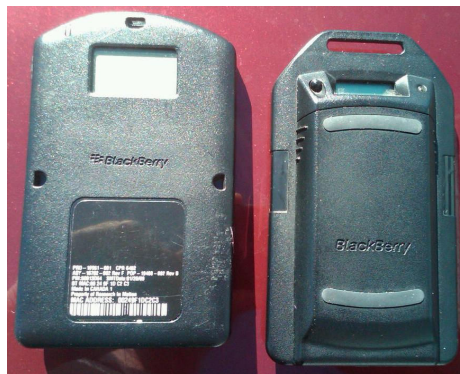
Figure 4. Hardware Revision Examples

Revision 2.0 Hardware Example on Left – Preceding Versions Example on Right with Removable Battery and One-Line LCD.