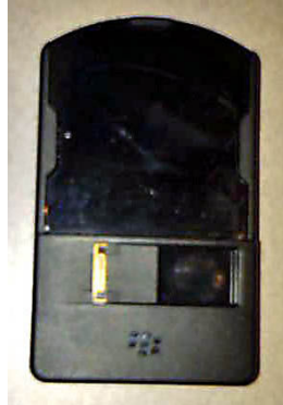
Figure 3. Cryptographic Module Boundary

The physical and cryptographic boundary of the module is the physical boundary of the BlackBerry Smartcard Reader that executes the BlackBerry Cryptographic Kernel and is the exterior of the Reader shown in the following figure. An additional security layer is provided via a potted and canned chip interior. Consequently, the embodiment of the module is multiple-chip standalone intended to meet FIPS 140-2 Level 3 requirements.