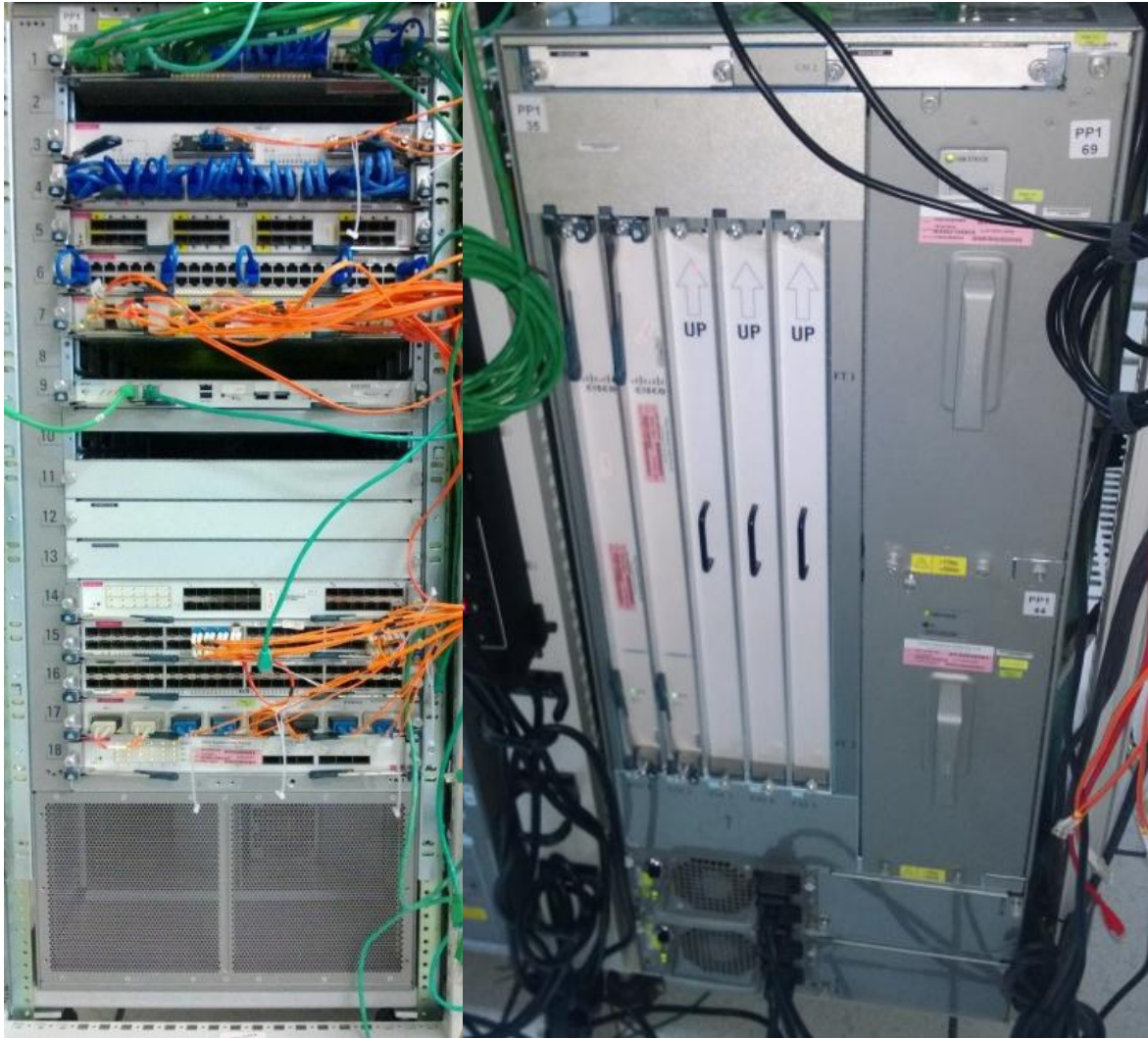
Figure 6 –Nexus 7000 (18-slot chassis) tested configuration 6 (Front and Back)