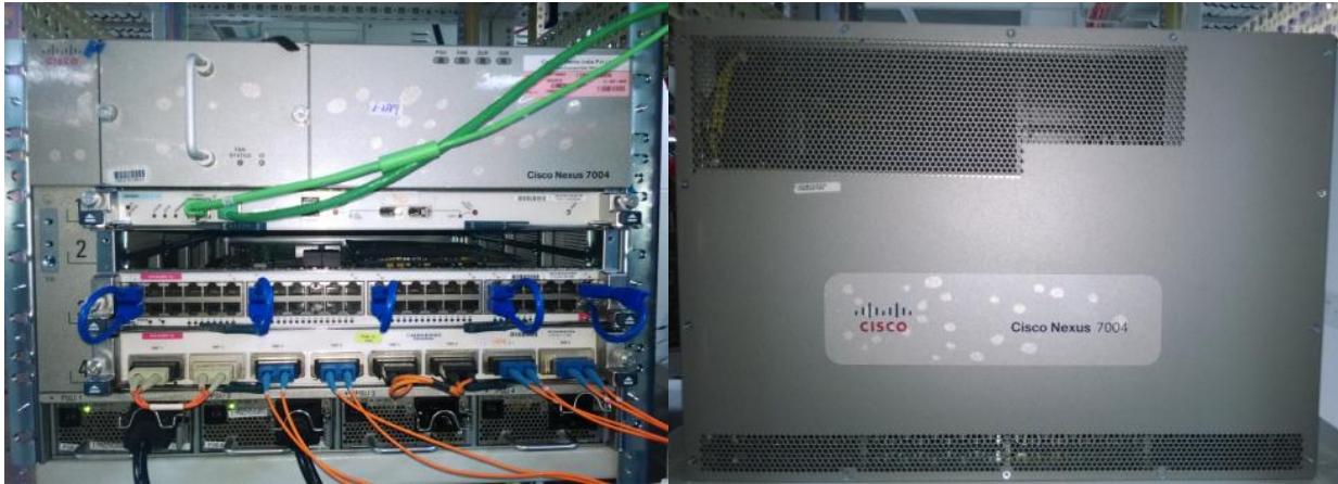
Figure 1 –Nexus 7000 (4-slot chassis) tested configuration 1 (Front and Back)