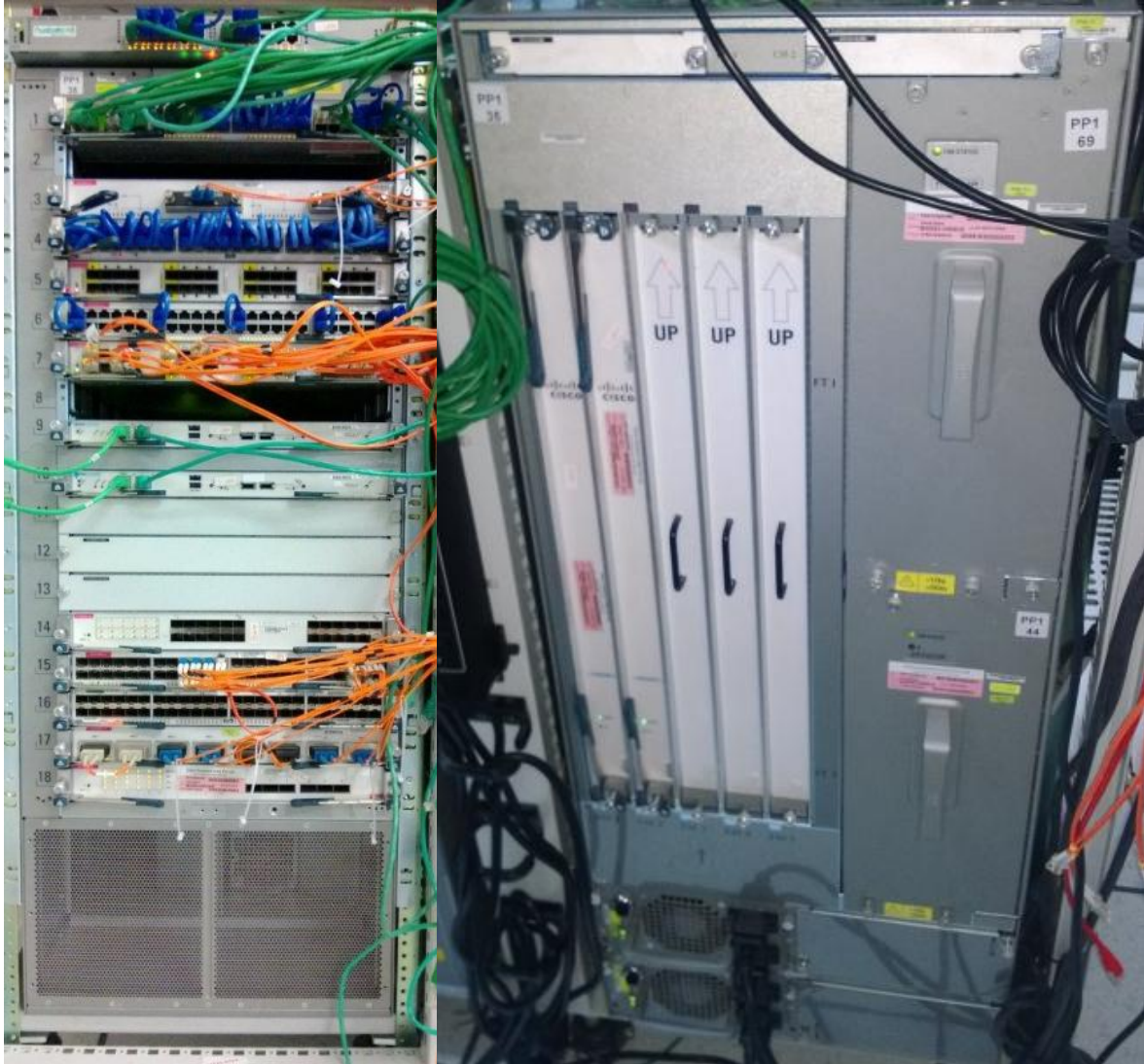
Figure 7 –Nexus 7000 (18-slot chassis) tested configuration 7 (Front and Back)