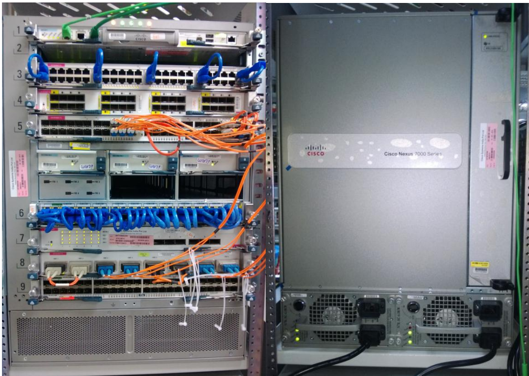
Figure 2 –Nexus 7000 (9-slot chassis) tested configuration 2 (Front and Back)