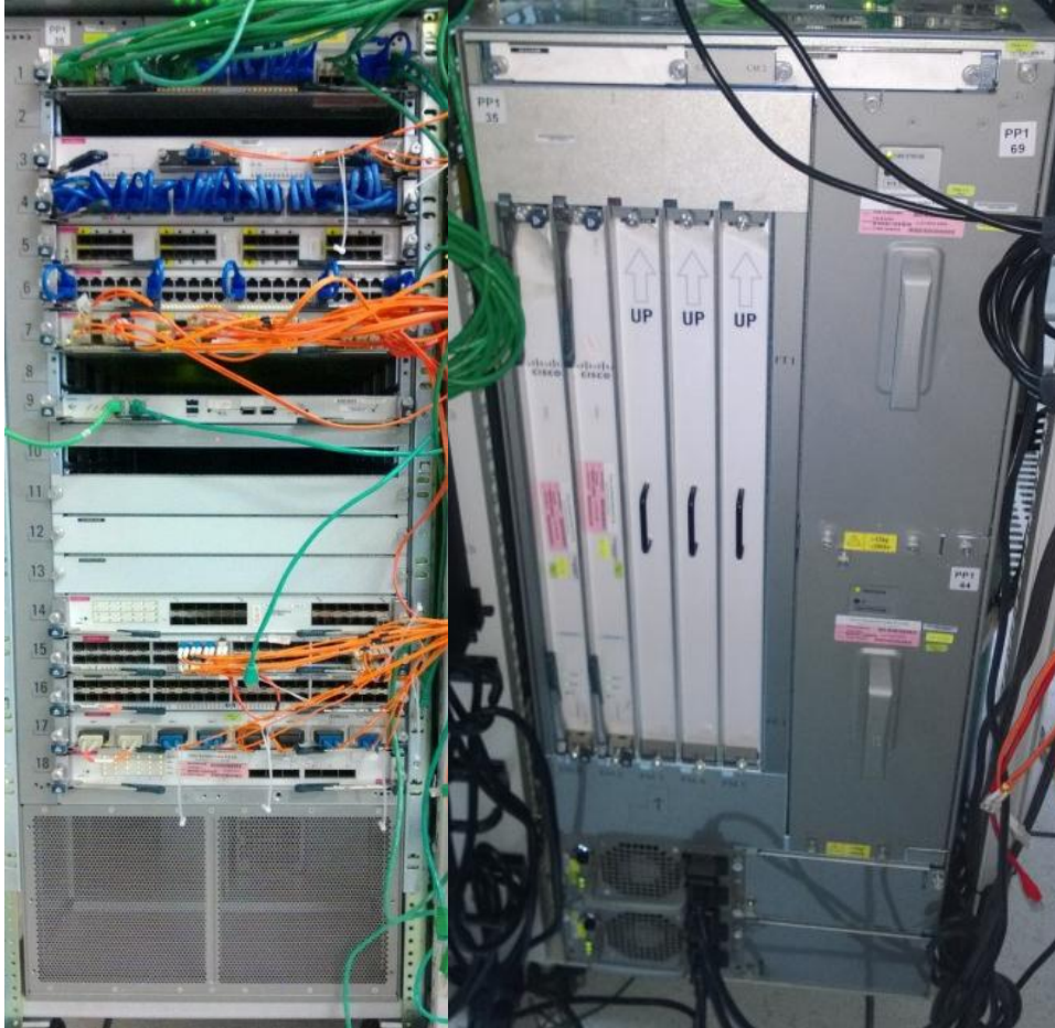
Figure 5 –Nexus 7000 (18-slot chassis) tested configuration 5 (Front and Back)