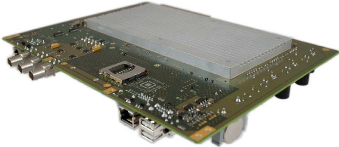
Figure 2 – MVC201 - back