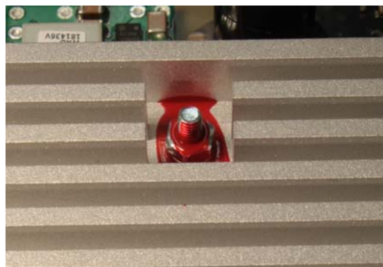
Figure 5 – Coating over screw

The seal-protected cover also acts as a heat sink and forms a hard enclosure in means of FIPS 140-2.