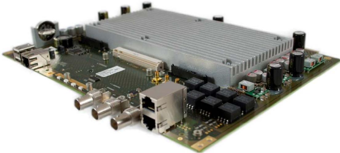
Figure 1 – MVC201 – front

The MVC201 is a printed circuit board (PCB) designed for integration into a Texas Instruments (TI) Series 2 DLP Cinema projector. The module's cryptographic boundary is the outer edge of the PCB. All parts outside the physically protected area on the board are excluded from the requirements of FIPS 140-2 because they are non-security relevant and cannot be used to compromise the security of the module.