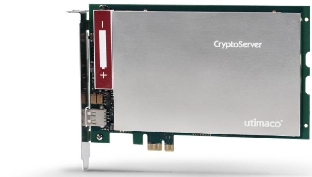
Figure 1 – CryptoServer CSe-Series

The picture below shows the cryptographic module CryptoServer CSe mounted on a PCIe carrier card: