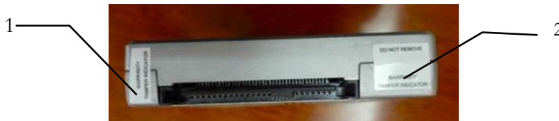
Figure 2: Tamper-Evident Seals