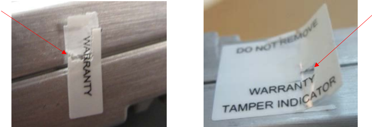
Figure 3: Tamper Evidence on Tamper Seals

The Crypto-Officer and/or User shall inspect the Cryptographic Module enclosure for evidence of tampering at least once a year. If the inspection reveals evidence of tampering, the Crypto-Officer should return the module to Western Digital.