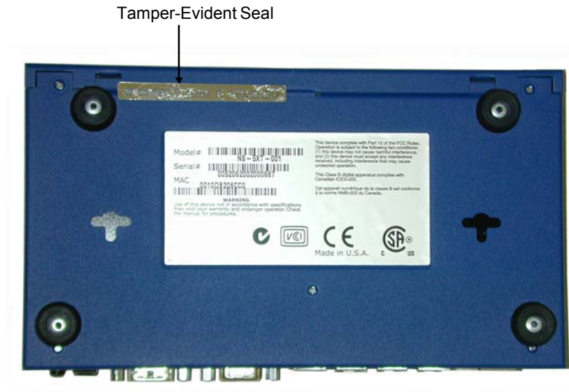
Figure 2 Tamper-Evident Seal