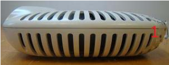
Figure 3: AP-134 Left View