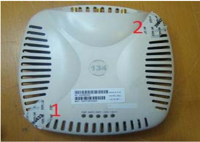
Figure 4: AP-134 Top View