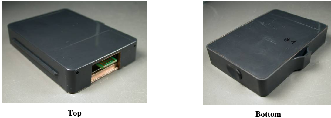
Figure 1 – Postal Security Device module (PSD)

The PSD (Figure 1) consists of a cryptographic sub function and postal services sub function sharing common hardware that is contained on a printed circuit board and enclosed within a hard, opaque, plastic enclosure encapsulating the epoxy potted module which is wrapped in a special tamper detection envelope with a response mechanism that causes the zeroization of plaintext CSPs. This enclosure constitutes the cryptographic physical boundary.