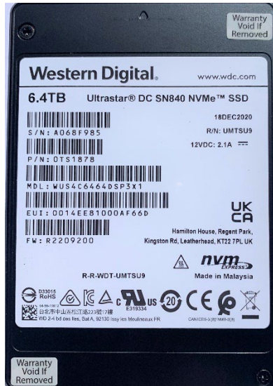
Figure 1: Ultrastar DC SN840 Cryptographic Module

The primary function of the module is to provide encrypted data storage, authenticated access control, and cryptographic erasure of the data stored on the solid-state media. The Cryptographic Module operator interfaces with the CM through a host system application.