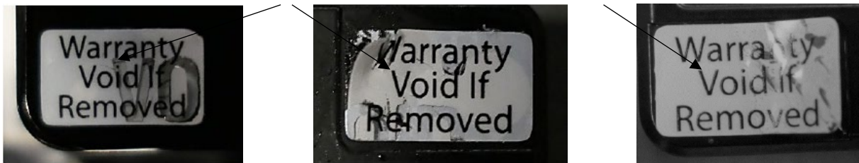
Figure 4: Tamper Evidence on Tamper Seal

The Crypto Officer and/or User shall inspect the Cryptographic Module enclosure at installation and at least once a year thereafter for evidence of tampering. See Figure 3: Tamper Evidence on Tamper Seal. If the inspection reveals evidence of tampering, the Crypto Officer should return the module to Western Digital.