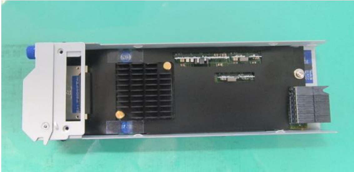
Figure 1 – Module

The physical form of the Module is depicted in Figure 1; the physical boundary of the cryptographic module is the same as the physical boundary depicted in Figure 1. Major components of the module are module board, micro processor, non-volatile memories and interfaces. The Module relies on Hitachi storage as input/output devices.