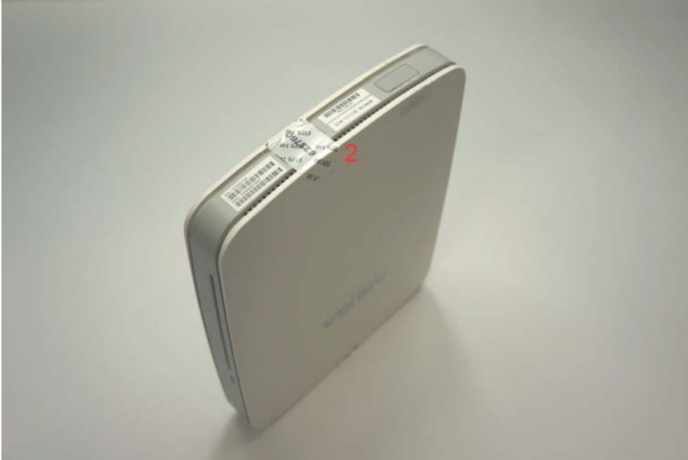
Figure 2 - RAP-155/155P Bottom View