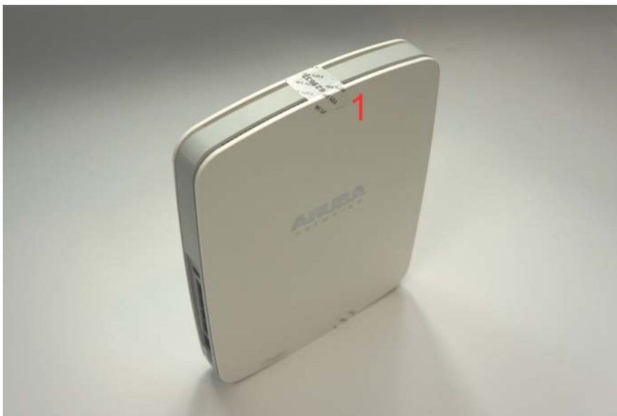
Figure 1 - RAP-155/155P Top View

Following is the TEL placement for the RAP-155/155P: