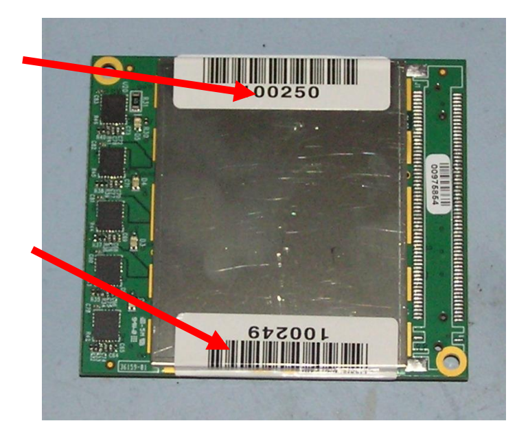
Figure 3 – 3e-636M Crypto Module Tamper Evidence Tape

Tamper evidence tapes are applied to the module at manufacturing time. Crypto Officer is responsible for checking tamper evidence tapes.