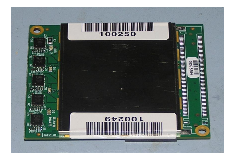
Figure 1 – 3e-636M Crypto Module

Figure 1 below shows the picture of the 3e-636M Crypto Module: