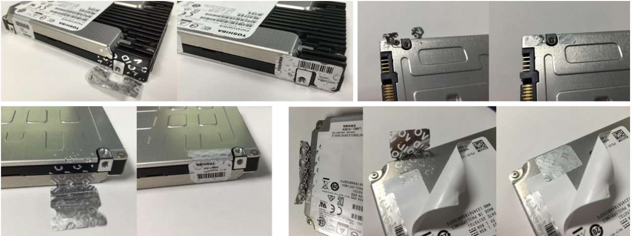
Mark of alphabetic character(s) which constitute a word “VOID”