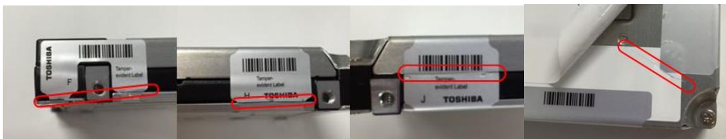
Cutting line (Security seals and OUTER SHEET)