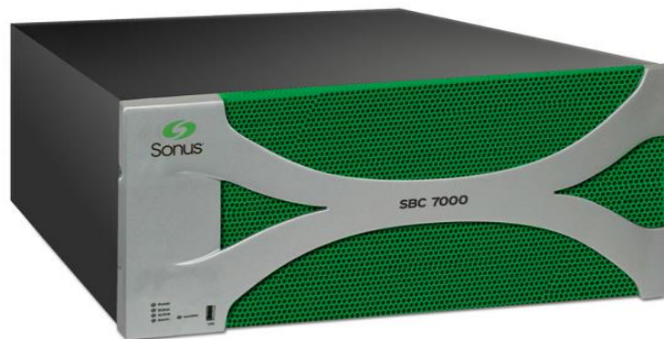
Figure 1 – Front View of SBC 7000

Figure 1 and Figure 2 below show a picture of the front and rear panels of the SBC 7000 Session Border Controller respectively.