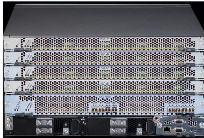
Figure 2 – Rear View of SBC 7000

The SBC is designed to fully address the next-generation need of SIP communications by delivering embedded media transcoding, robust security and advanced call routing in a high-performance, medium form-factor device. The SBC 7000 is designed to accommodate upto 150,000 call sessions. Some of the network and security features provided by the module include: