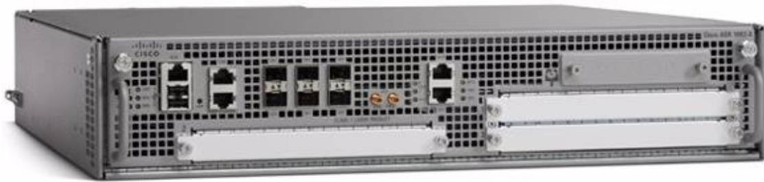
Figure 1: ASR 1002-X

With routing performance and IPsec Virtual Private Network (VPN) acceleration around ten-fold that of previous midrange aggregation routers with services enabled, the Cisco ASR 1000 Series Routers provides a cost-effective approach to meet the latest services aggregation requirement. This is accomplished while still leveraging existing network designs and operational best practices.