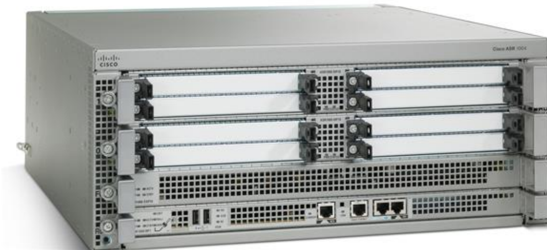
Figure 2: ASR 1004