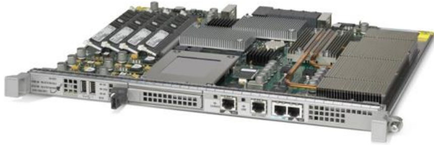
Figure 5: Route Processor 2