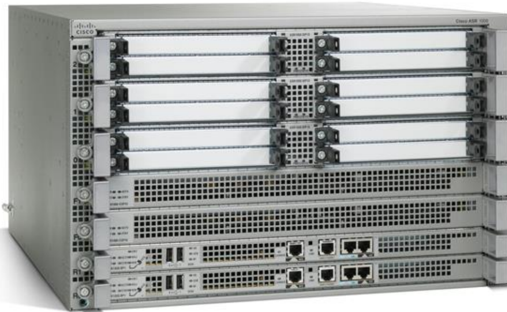
Figure 3: ASR 1006