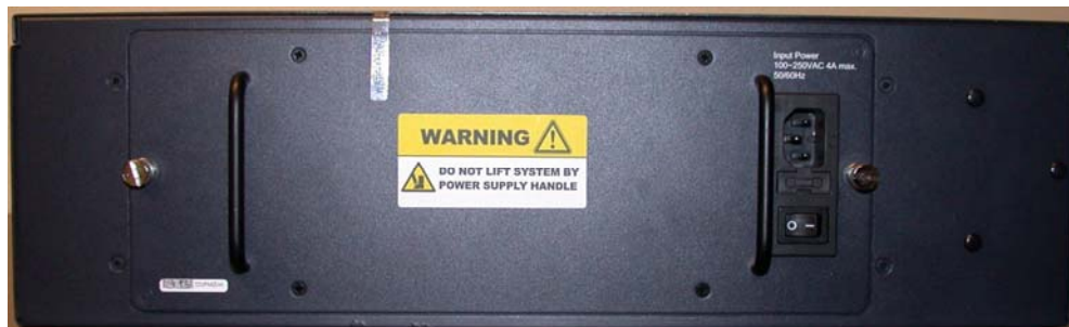
Fig. 4: Rear of ISG 1000