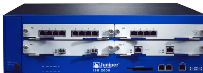
Fig. 2: NetScreen-ISG 2000