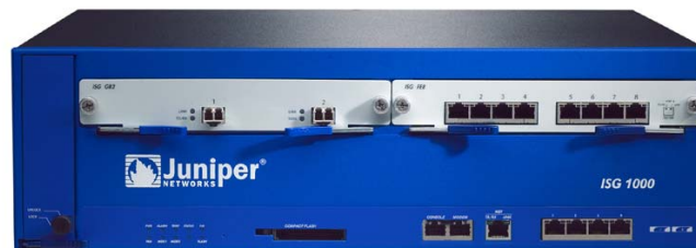
Fig. 1: NetScreen-ISG 1000

The entire case is defined as the cryptographic boundary of the module. The NetScreen-ISG series physical configuration is defined as a multi-chip standalone module. The chips are production-grade quality and include standard passivation techniques. The NetScreen-ISG series conforms to FCC part 15, class A.