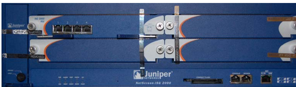
Fig. 5: Front of the ISG 2000