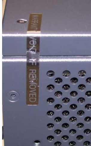
Fig. 7: Tamper-evident seal applied to rear corner

Tamper-evident seals should be applied to: