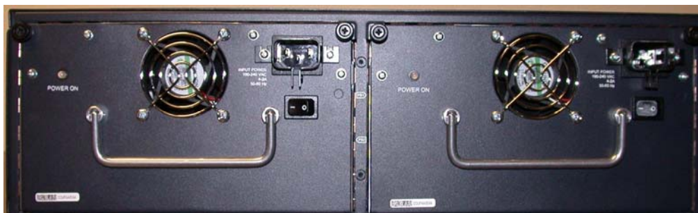
Fig. 6: Rear of the ISG 2000