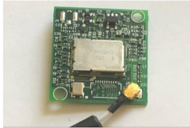
Figure 1 - Module's Hardware Component (Zebra WLAN Core)

The module is defined as a multi-chip standalone Firmware-hybrid module (thin red line area), with the boundary of the Tested Operational Environment's Physical Perimeter (TOEPP) being defined as the physical perimeter of the tested platform enclosure around which everything runs.