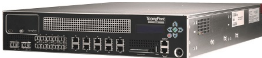
Figure 2: TippingPoint S6100N

The module configurations are shown in the picture below: