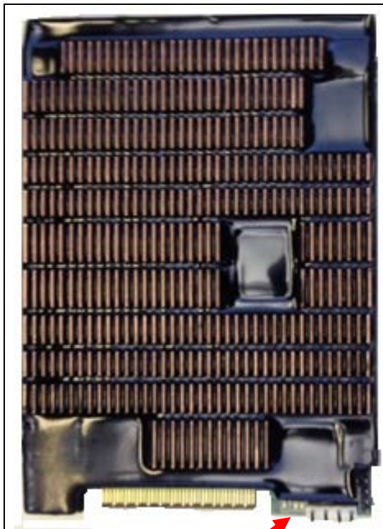
Figure 3- Top View of P/N FN1620-NFBE2-G