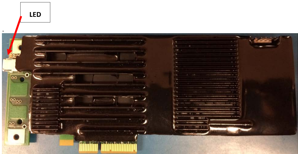
Figure 1 – Top View of NITROX XL 1600-NFBE HSM

The module is a hardware/firmware multi-chip embedded cryptographic module. The module provides cryptographic primitives to accelerate approved and allowed algorithms for TLS 1.0/1.1/1.2 and SSH. The cryptographic functionality includes modular exponentiation, random number generation, and hash processing, along with protocol specific complex instructions to support TLS 1.0/1.1/1.2 security protocols using the embedded NITROX chips. The module implements single and two factor authentication at FIPS 140-2 Level 3 security. The physical boundary of the module is implemented by an epoxy enclosure.