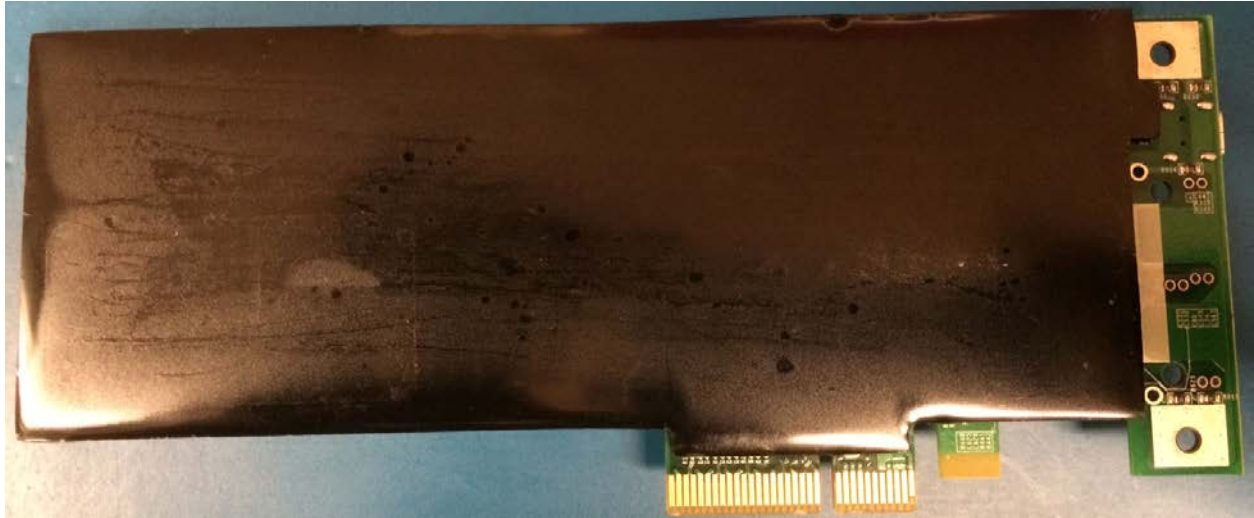
Figure 2 – Bottom view of NITROX XL 1600-NFBE HSM