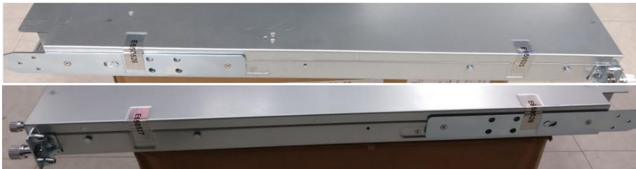
Figure 2 – Tamper Evidence Label Locations

Figure 2 identifies the locations of the four tamper evidence labels applied during the manufacturing process.