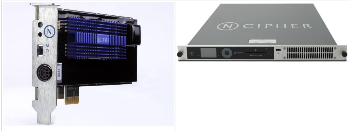
Table 2 nShield Solo (left) and nShield Connect (right)

The cryptographic boundary is delimited in red in the images in the table below. It is delimited by the heat sink and the outer edge of the potting material on the top and bottom of the PCB.