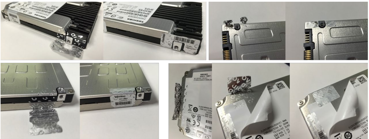
Mark of alphabetic character(s) which constitute a word “VOID”