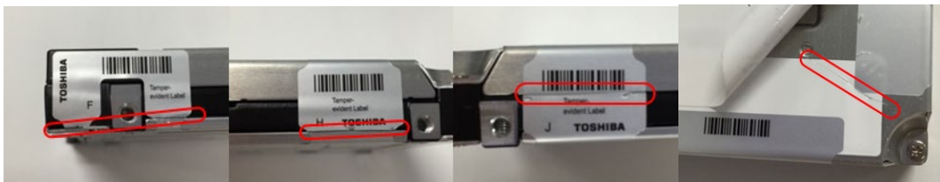
Cutting line (Security seals and OUTER SHEET)