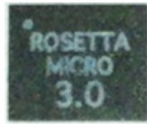
SPYCOS Module Top View

Images of the above form factor is shown in the figure below: