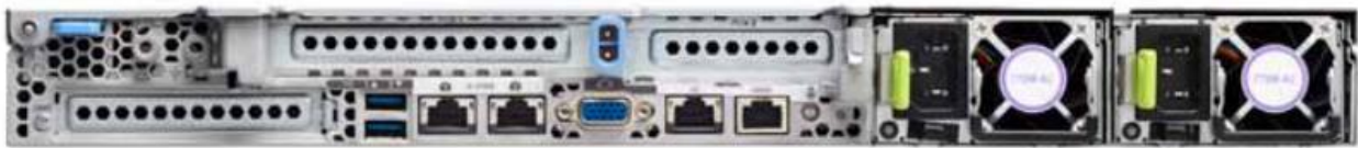
Figure 2 UCS C220 M5 Rear view

In addition to the platforms listed in Table 2, Cisco has also tested the module on the following platforms and claims vendor affirmation on them.