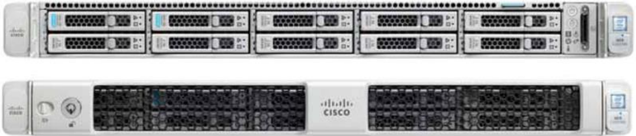
Figure 1 UCS C220 M5 Front view without Bezel (top) and with Bezel (bottom) 1