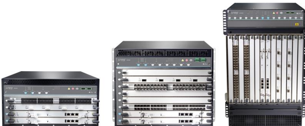
Figure 1 – Physical Cryptographic Boundary (Left to Right: MX240, MX480, MX960)

The images below depict the physical boundary of the modules, including the Routing Engine, the MACsec line card (the MPC7E-10G for the MX Series and the EX9200-40XS for the EX Series) and SCB. The boundary excludes the non-crypto-relevant line cards included in the figure. The modules exclude the power supplies from the requirements of FIPS 140-2. The power supplies do not contain any security relevant components and cannot affect the security of the module.