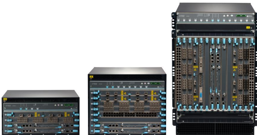
Figure 2 – Physical Cryptographic Boundary (Left to Right: EX9204, EX9208, EX9214)