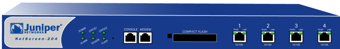
Figure 1: Front of the NetScreen-204 device