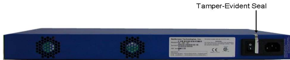
Figure 2: Tamper evident seal on power interface