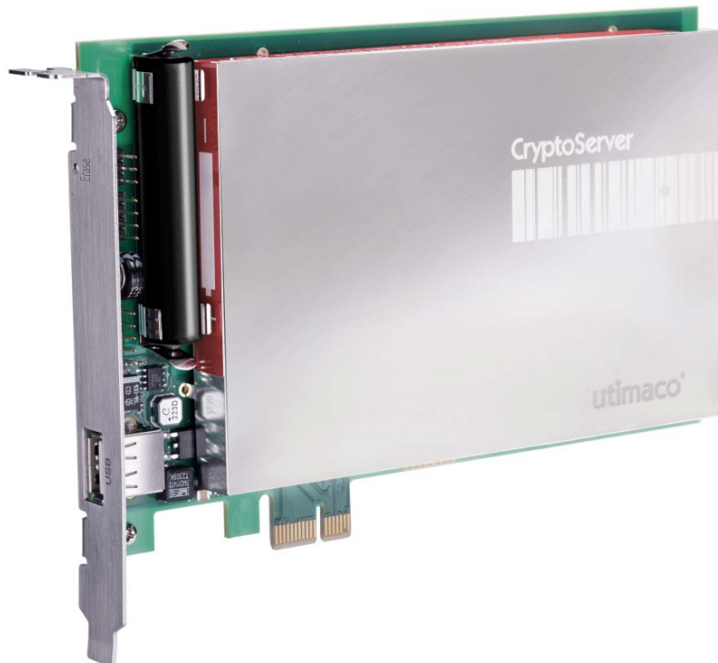
Figure 2: –CryptoServer CSe mounted on the PCIe carrier card

The following picture shows the cryptographic module CryptoServer CSe mounted on a PCIe carrier card: