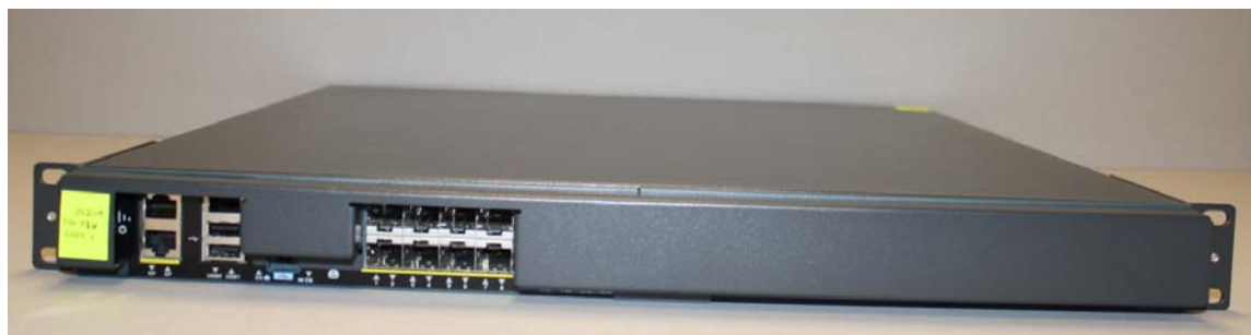
Figure 1 Entire Module

The module automatically detects, authorizes and configures access points, setting them up to comply with the centralized security policies of the wireless LAN. In a wireless network operating in this mode, WPA2 protects all wireless communications between the wireless client and other trusted networked devices on the wired network with AES-CCMP encryption. CAPWAP protects all control and bridging traffic between trusted network access points and the module with DTLS encryption.