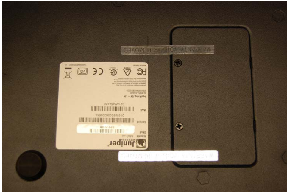
Figure 8: Underside of both SSG 5 and 20 devices, with location of tamper evident seal

Tamper evident seals should be applied to: