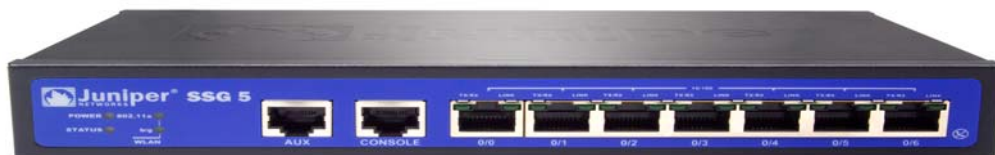
Figure 3: Front of the SSG 5 device

The administrator must seal the metal enclosure of the device with tamper-evident tape and inspect the seals on a periodic basis to ensure that they are intact. Seals are available for order via part number JNPR-FIPS-TAMPER-LBLS. If a seal is missing or damaged, the device may have been tampered with. Tamper-evident seals should be applied as described below.