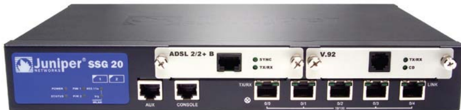
Fig. 2: SSG 20