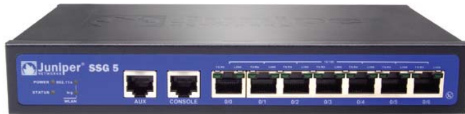
Fig. 1: SSG 5

The entire case is defined as the cryptographic boundary of the module. The SSG 5/20 series physical configuration is defined as a multi-chip standalone module. The chips are production-grade quality and include standard passivation techniques. The SSG 5/20 series conforms to FCC part 15, class B.