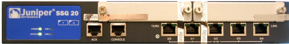
Figure 5: Front of the SSG-20 device