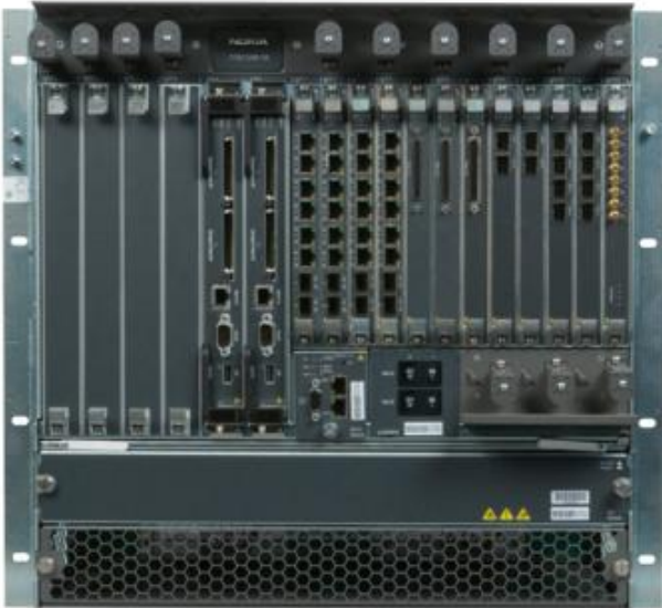
Figure 2-3: Picture of the SAR-18