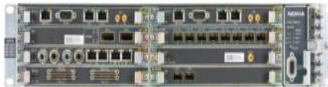
Figure 2-2: Picture of the SAR-8

The firmware version used to validate version 1.0 of the SARDCM was SAR-OS 21.10R5.