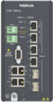
Figure 2-5: Picture of the SAR-Hc