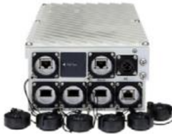
Figure 2-8: Picture of the SAR-Wx