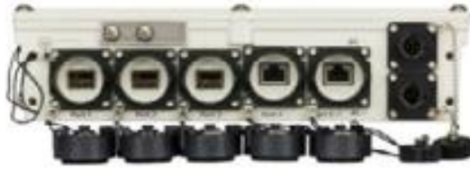
Figure 2-7: Picture of the SAR-W