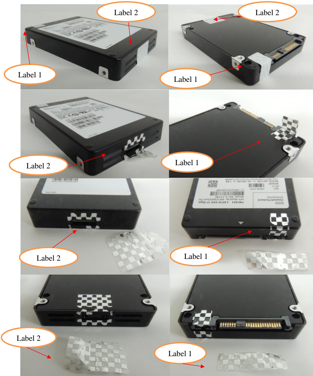
Exhibit 15 - Signs of Tamper