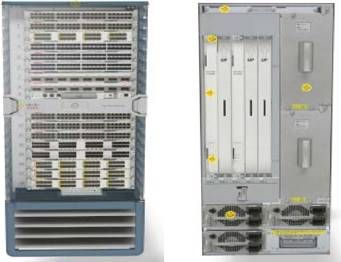
Figure 1 – Front and Back of the Nexus 7000 (18-slot chassis)