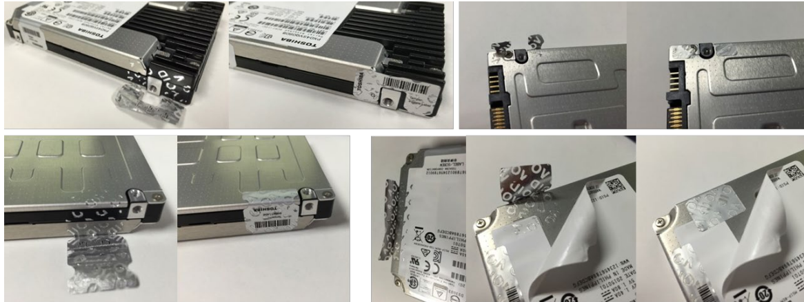
Figure 2 - Mark of alphabetic character(s) which constitute a word "VOID"