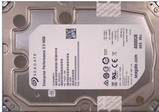
Figure 1: Top view of tamper-evidence label on sides of Enterprise Performance HDD v1, 3.5-inch, 10K-RPM, SAS Interface module