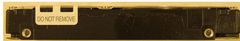
Figure 9: Right-side view of tamper-evidence label on right side of Enterprise Performance HDD v9, 2.5-Inch, 10K-RPM, SAS Interface module