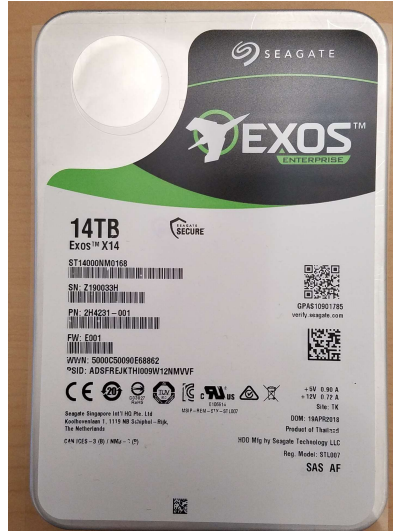
Exos™ X14 Enterprise, 3.5", 7.2 K-RPM, SAS Interface, 14TB