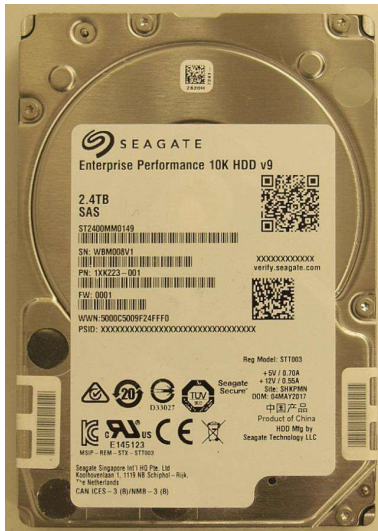
Enterprise Performance® HDD v9, 2.5", 10K-RPM, SAS Interface, 2400GB