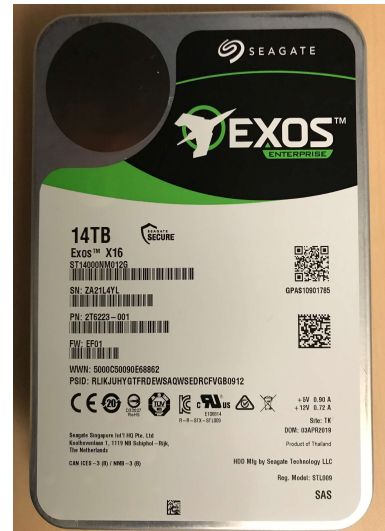
Exos™ X16 Enterprise, 3.5", 7.2 K-RPM, SAS Interface, 14TB