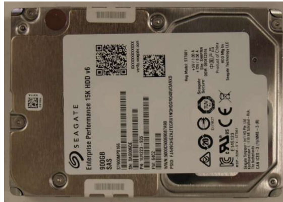
Figure 4: Top view of tamper-evidence label on sides of Enterprise Performance HDD v6, 2.5-Inch, 15K-RPM, SAS Interface module