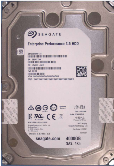
Enterprise Performance® HDD v1, 3.5", 10K-RPM, SAS Interface, 4000GB

This document is non-proprietary and may be reproduced in its original entirety.