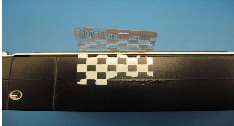
Figure 10: Enterprise Performance HDD v1, 3.5-inch, 10K-RPM, SAS Interface & Enterprise Performance HDD v6, 2.5-Inch, 15K-RPM, SAS Interface module Top Cover Tamper Evidence