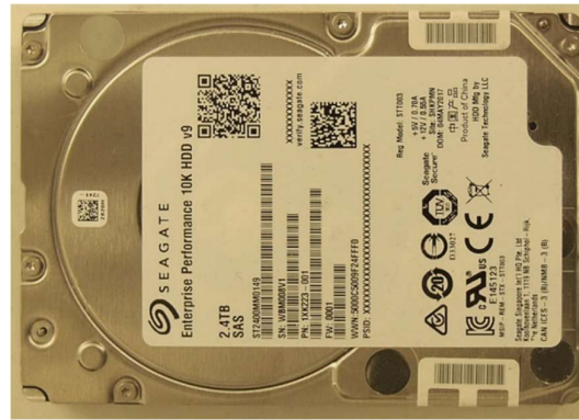
Figure 7: Top view of tamper-evidence label on sides of Enterprise Performance HDD v9, 2.5-Inch, 10K-RPM, SAS Interface module