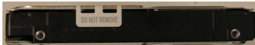
Figure 6: Right-side view of tamper-evidence label on right side of Enterprise Performance HDD v6, 2.5-Inch, 15K-RPM, SAS Interface module