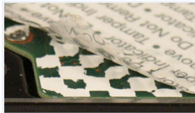
Figure 11: Enterprise Performance HDD v1, 3.5-inch, 10K-RPM, SAS Interface, Enterprise Performance HDD v6, 2.5-Inch, 15K-RPM, SAS Interface, Enterprise Capacity HDD v6, 3.5-inch, 7K-RPM, SAS Interface module PCBA Tamper Evidence. Label lifted off.