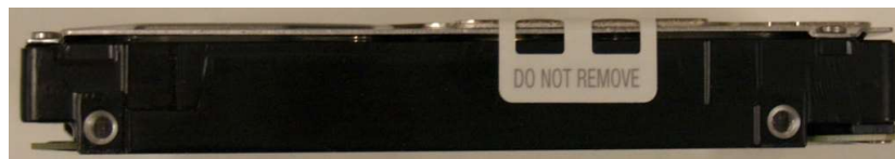
Figure 5: Left-side view of tamper-evidence label on left side of Enterprise Performance HDD v6, 2.5-Inch, 15K-RPM, SAS Interface module