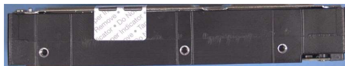
Figure 3: Right-side view of tamper-evidence label on right side of Enterprise Performance HDD v1, 3.5-inch, 10K-RPM, SAS Interface module