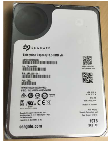
Enterprise Capacity® HDD v6, 3.5", 7K-RPM, SAS Interface, 10,000GB