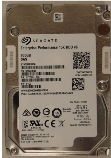
Enterprise Performance® HDD v6, 2.5", 15K-RPM, SAS Interface, 900GB, 600GB