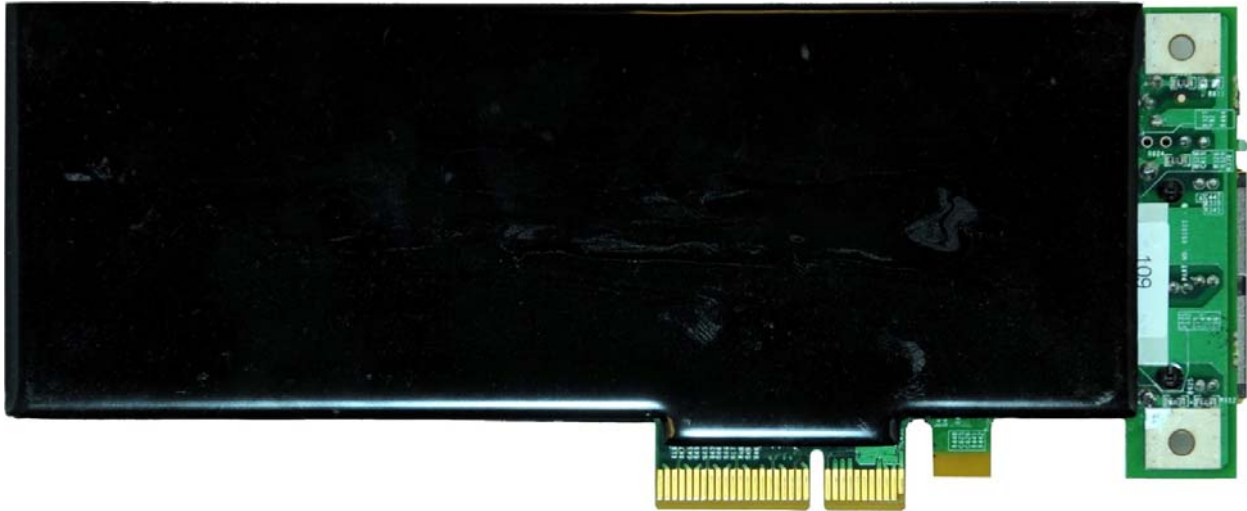
Figure 2 – Bottom view of Cryptographic Module

The configuration of hardware and firmware for this validation is: