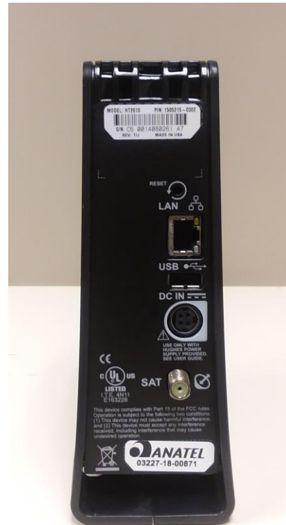
Figure 3 – HT2010 Rear View