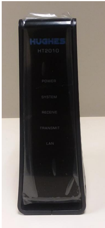
Figure 2 – HT2010 Front View