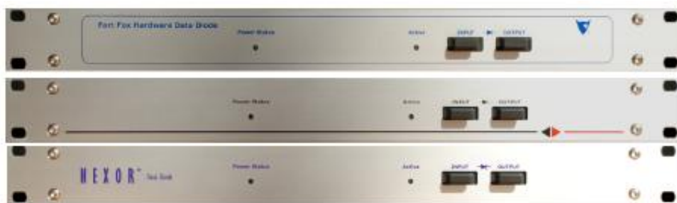
Figure 3 Three variants for the front panels of the TOE