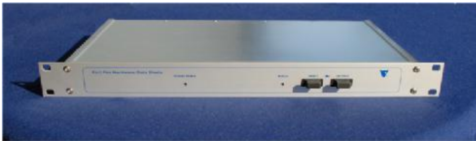
Figure 2 The TOE

The TOE has two operational interfaces to establish one-way communication, the Bidirectional Input and Unidirectional Output port. At the Low Security Level Transceiver light is carried into the Bidirectional Input port and converted, with the aid of a photocell, into an electrical signal. The electrical signal spreads through the TOE to the High Security Level Transceiver. The High Security Level Transceiver receives the electrical signal and converts this, using a light source, into light. Finally, the light is offered, through the Unidirectional Output port, to the High Security Level Network.