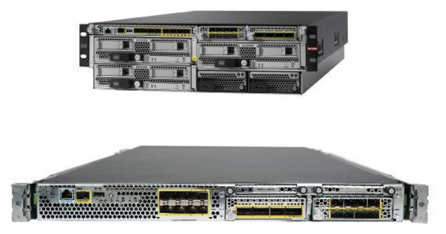
Figure 1: FP 9300 (first) and FP 4100 (second)

The hardware components in the TOE have the following distinct characteristics: