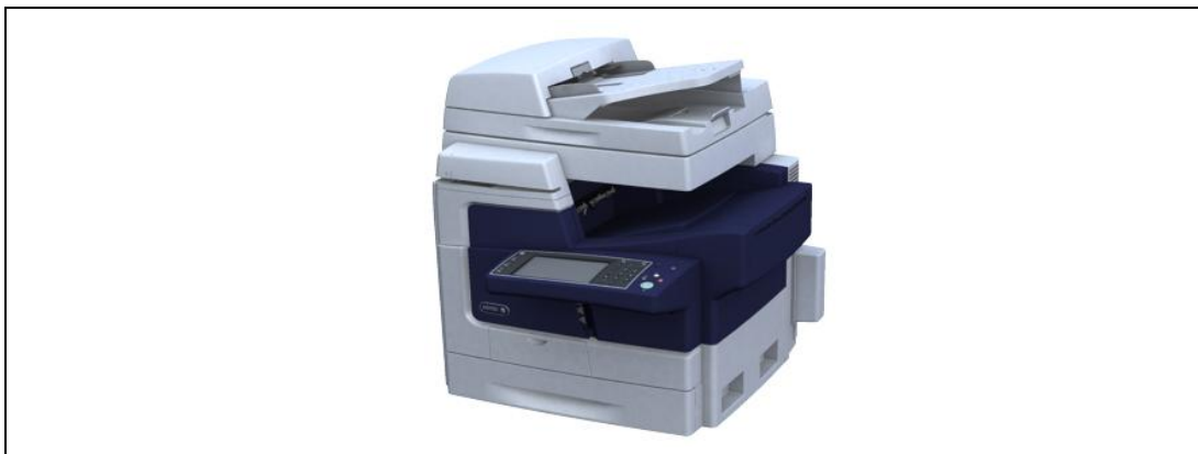
Figure 1: Xerox ColorQube™ 8700/8900

The TOE can integrate with an IPv4 or IPv6 network with native support for DHCP/DHCPv6. The hardware included in the TOE is shown in Figure 1 below.