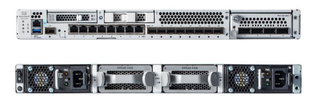
Figure 1: Cisco Secure Firewall 3100 Series Hardware (3105, 3110, 3120, 3130 and 3140)

The Cisco Secure Firewall 3100 models have the following distinct characteristics: