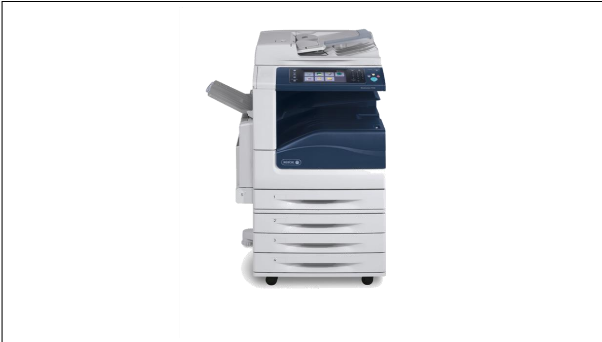
Figure 1: WorkCentre® 7845/7855 Xerox® ConnectKey® Technology with SIPRNet Support

The TOE can integrate with an IPv4 network with native support for DHCP. The hardware included in the TOE is shown in the figure below.