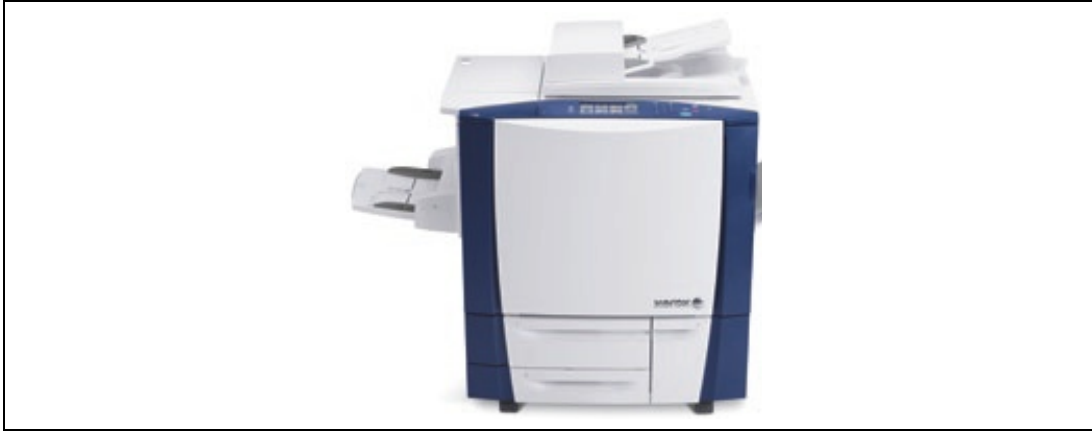
Figure 5: Xerox ColorQube 9301/9302/9303 ConnectKey 1.5 Technology

Table 2 below shows the various models and capabilities of the TOE. The models vary in printing speed, paper capacity and available finsher options.