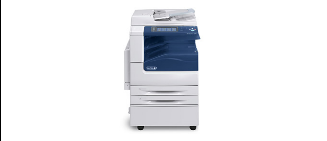
Figure 2: Xerox WorkCentre 7220/7225