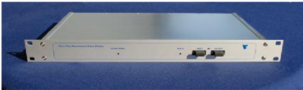
Figure 2 The TOE

The TOE has two operational interfaces to establish one-way communication, the Bidirectional Input and Unidirectional Output port. At the Low Security Level Transceiver light is carried into the Bidirectional Input port and converted, with the aid of a photocell, into an electrical signal. The electrical signal spreads through the TOE to the High Security Level Transceiver. The High Security Level Transceiver receives the electrical signal and converts this, using a light source, into light. Finally, the light is offered, through the Unidirectional Output port, to the High Security Level Network.