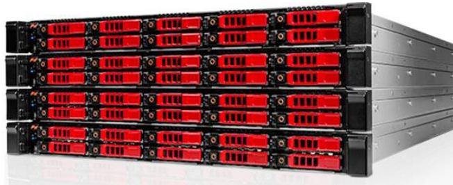
Figure 1: Typical SolidFire Cluster