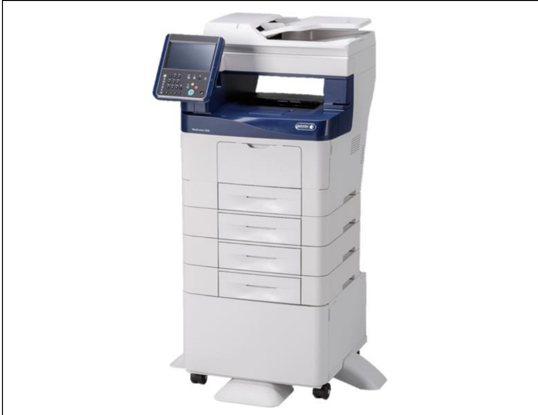
Figure 1: Xerox® WorkCentre® 6655/6655i 2016 Xerox® ConnectKey® Technology

The TOE can integrate with an IPv4 network with native support for DHCP. The hardware included in the TOE is shown in the figure below.