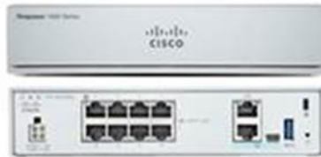
Figure 2: FP1000 Series Hardware (1120, 1140)