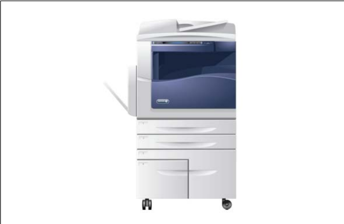
Figure 1: WorkCentre® 5945/5955 Xerox® ConnectKey® Technology with SIPRNet Support

The TOE can integrate with an IPv4 network with native support for DHCP. The hardware included in the TOE is shown in the figure below.